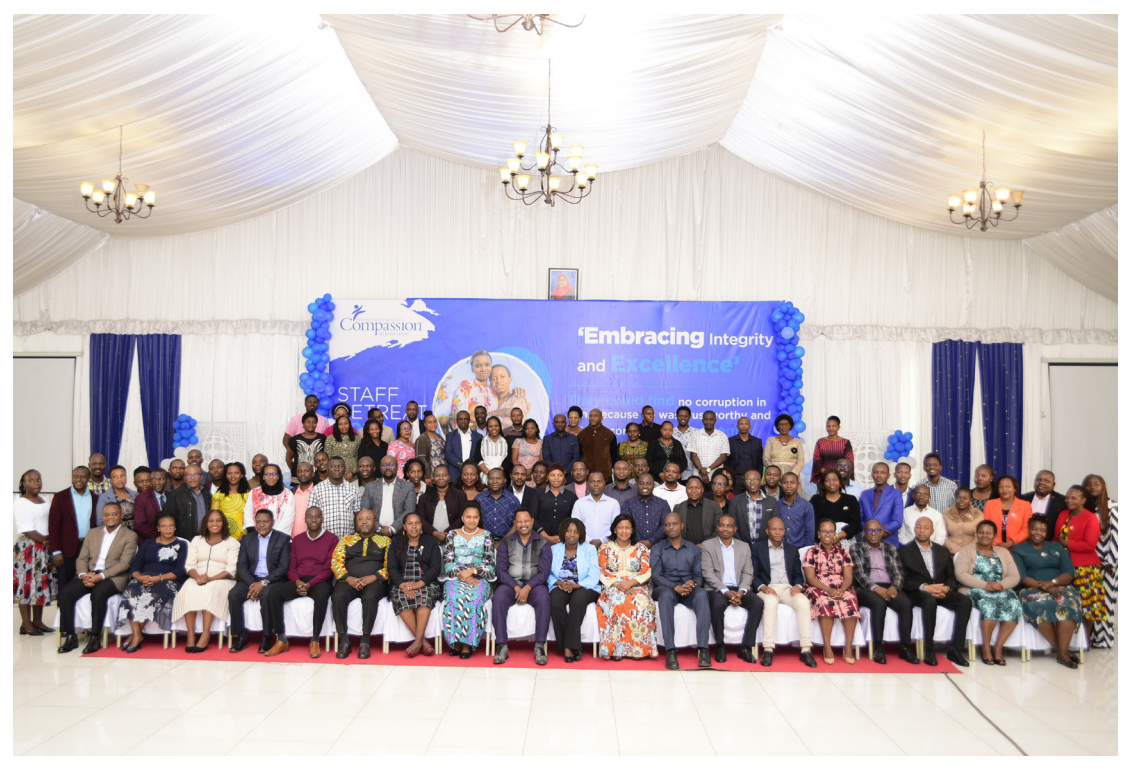
All staff during the second day of retreat at Mt. Meru Hotel

Embracing Excellence and Integrity with Compassion International