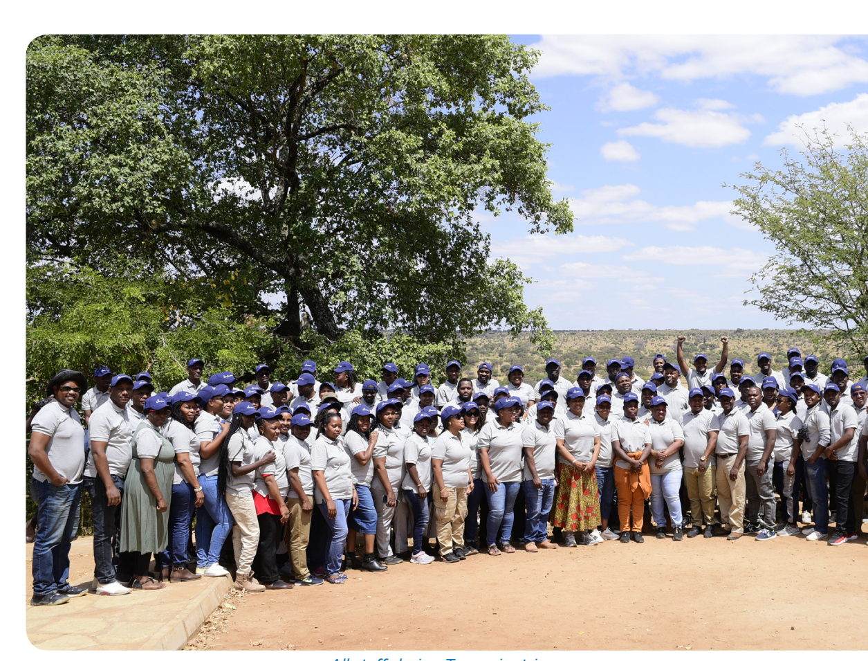
All staff during Tarangire trip

The retreat wasn't just about spiritual nourishment; it included financial well-being sessions, team building activities, and a night of traditional shows and barbecue. The diverse range of activities, from chasing chickens where the National Director