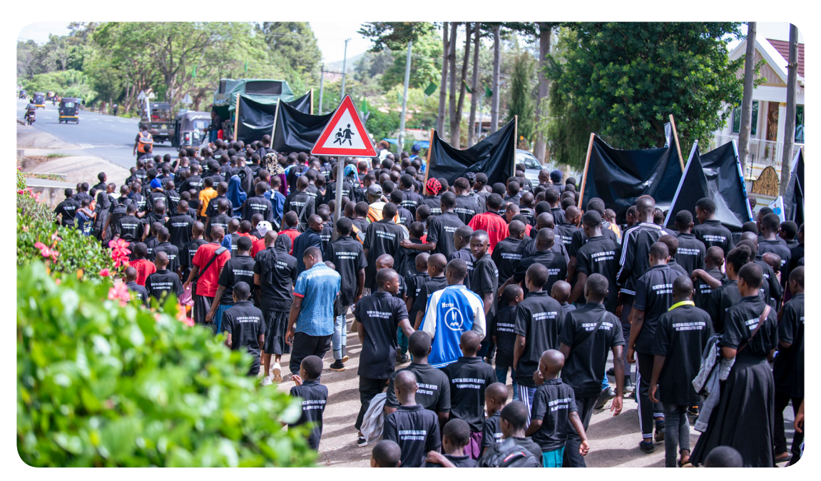
Youth and Children in Iringa during recent peaceful demonstration

n the heart of Iringa, a region marred by distressing incidents of child cruelty, Compassion International Tanzania, in collaboration with 13 Child and Youth Development Centers (CYDCs) took a stand against the rising tide of child abuse. Media reports consistently highlighted the alarming number of cases pouring into Iringa District Court, prompting a call to action.