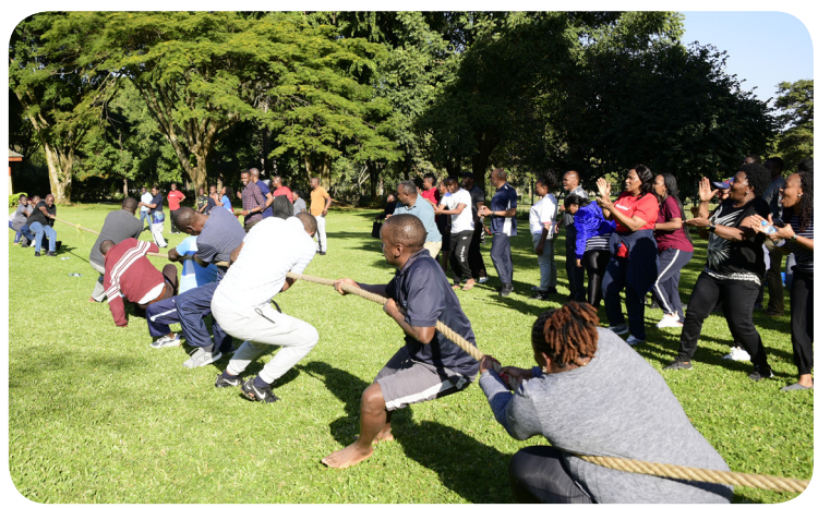
Tug of war game during team building activities