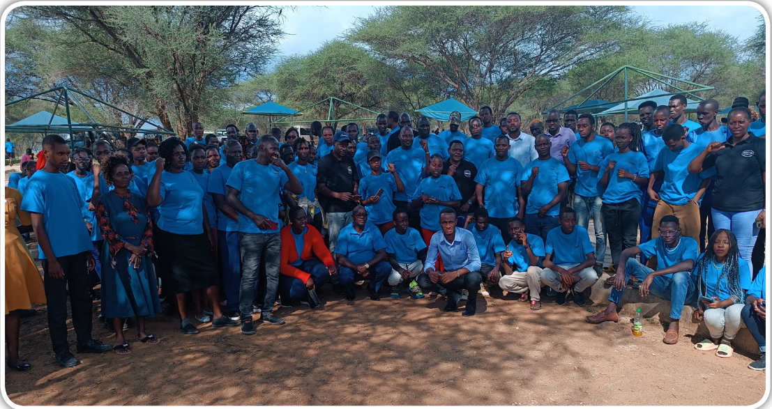
United in Purpose: Tanzanian and Kenyan youth stand together, empowered by compassion and courage, forging lasting connections at the Inter-Country Collaboration Camp in Arusha, Tanzania.

Compassion International Tanzania and Compassion International Kenya recently facilitated a one-week youth camp as part of youth empowerment. The heart of the Inter-Country Collaboration Camp aimed to foster mutually beneficial relationships between Tanzanian and Kenyan youth. More than 130 youth aged 17-22 gathered at Oldoyosambu Arusha, Tanzania, for a transformative experience themed “Courage to Stand Out.”