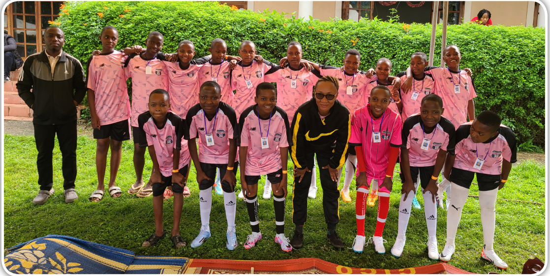
One of the proud teams, supported by Compassion, gathers for a photo ahead of the Chipukizi Cup 2023 competitions, ready to showcase their talent and determination.

The East African Chipukizi Cup stands as a beacon of hope and unity, bringing together young talents from across the region to celebrate the beautiful game of football. This annual event, which began over a decade ago, has grown exponentially, showcasing the immense talent and potential of East African youth.