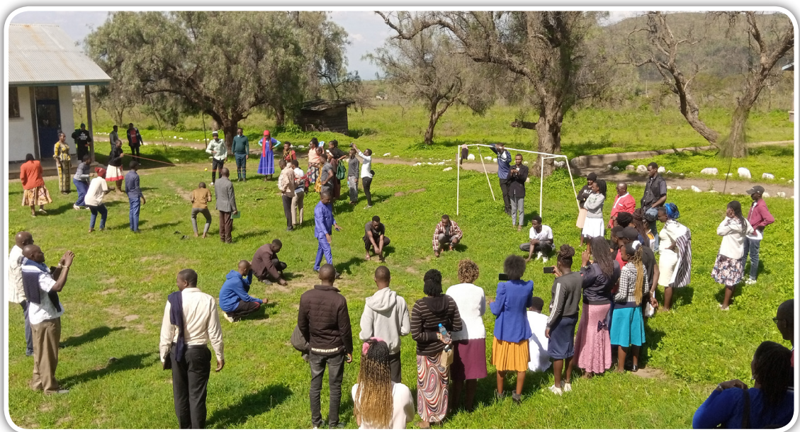
Enthusiastic youth from Tanzania and Kenya in team-building exercises fostering camaraderie and collaboration.

This camp was more than just an educational experience; it was an investment in the talents and potential of the youth. It provided a platform for them to explore their abilities, develop critical skills, and pursue their dreams. As Compassion continues to invest in the youth, it is creating an environment where they are encouraged to thrive and make a positive impact on their communities and beyond.